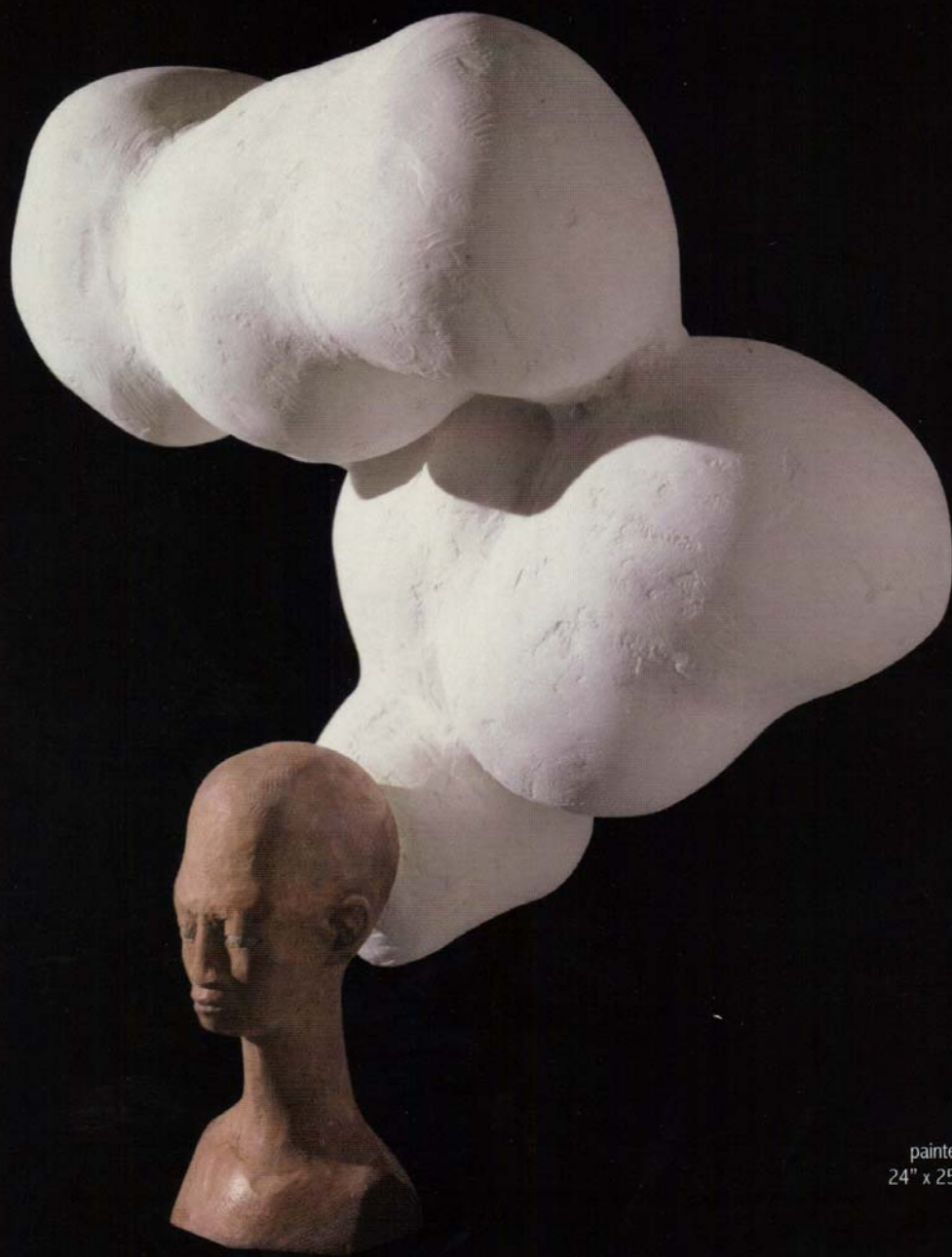
milky # 2 , 2000 painted wood and plaster 24" x 25" x 18" (H x W x D)